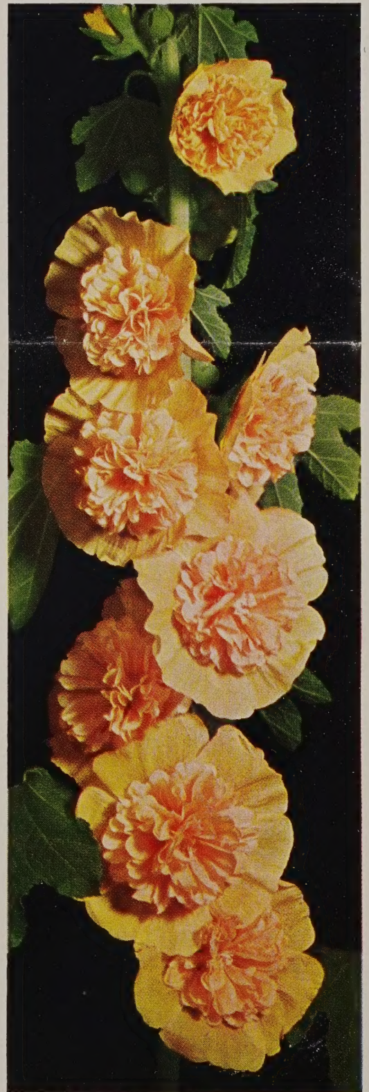
Hollyhock, Queen of Sheba

For Finest Results Use Scheepers' Bulb Food